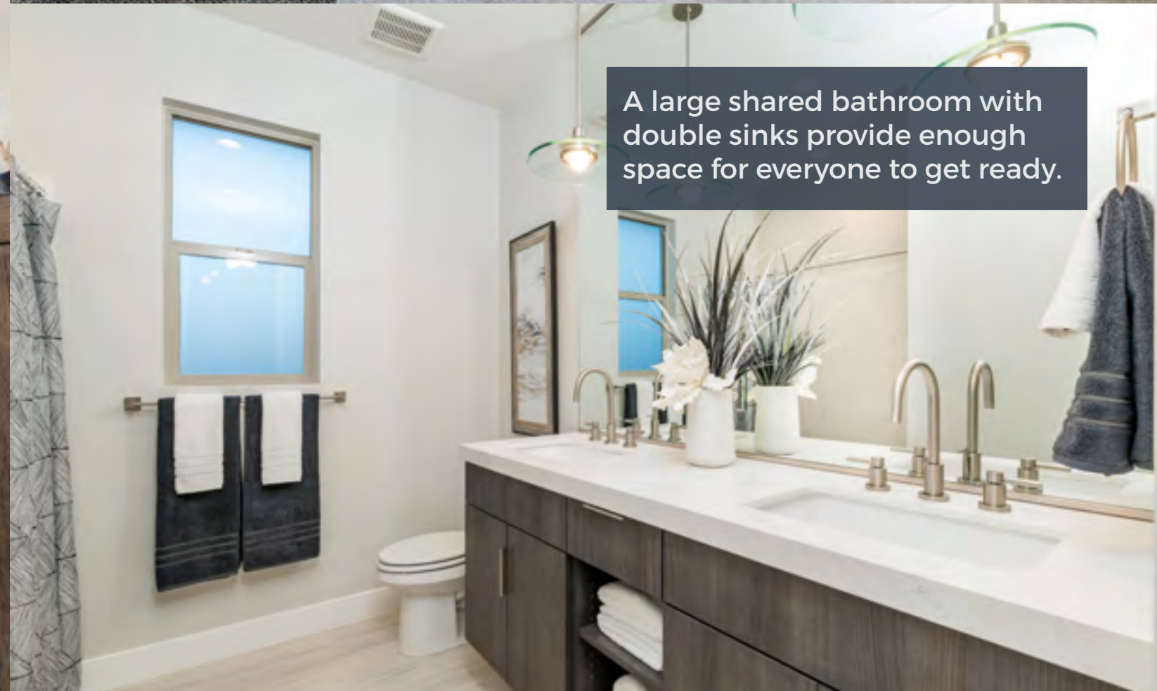
A large shared bathroom with double sinks provide enough space for everyone to get ready.