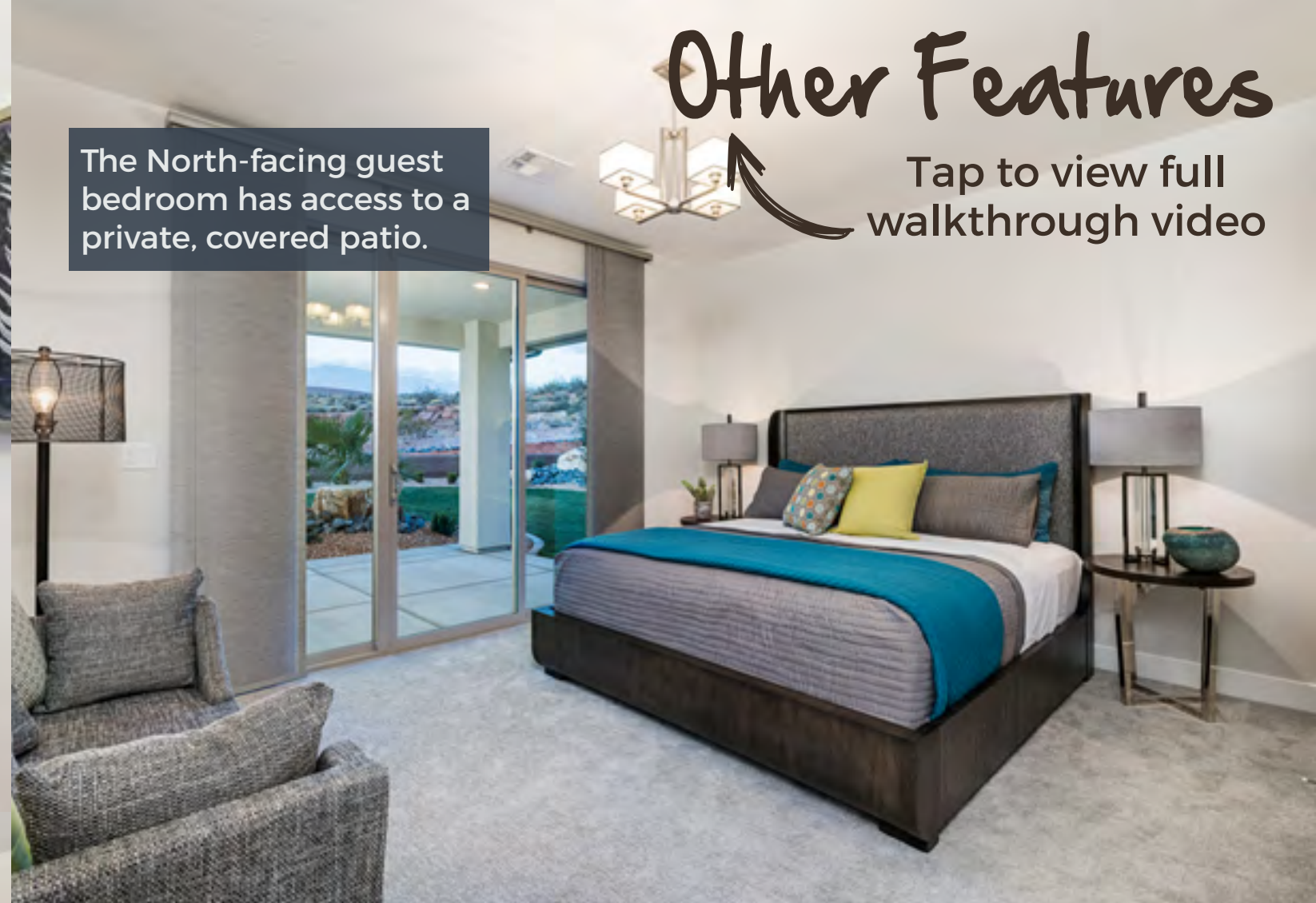
The North-facing guest bedroom has access to a private, covered patio.