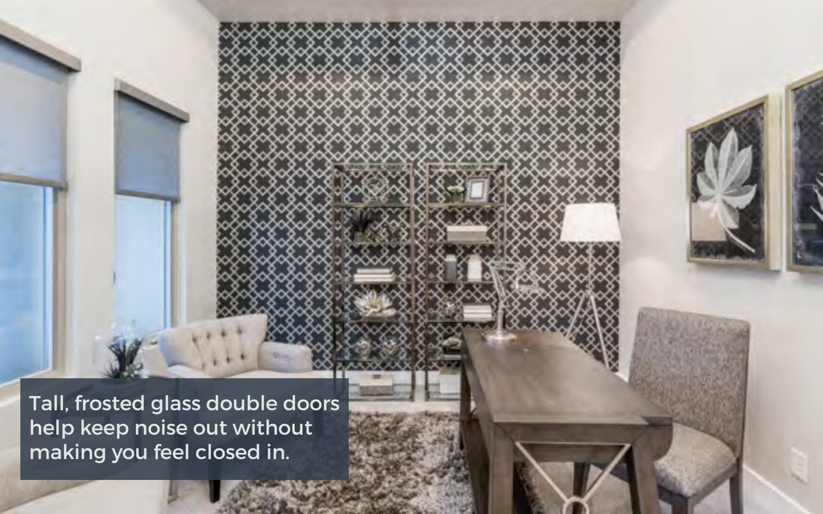
Tall, frosted glass double doors help keep noise out without making you feel closed in.